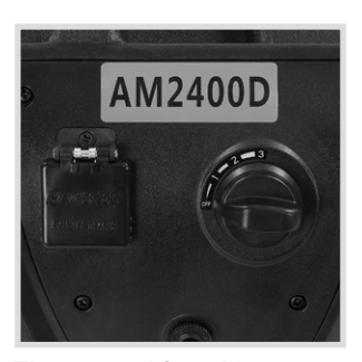
Three-speed fan with built-in power outlet.