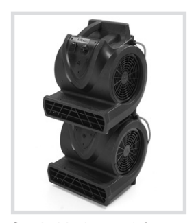
Stackable (up to 3) for easy storage.