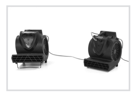
Daisy chain up to 3 units.