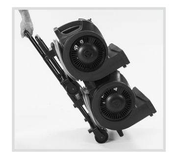
Optional trolley kit, with transport wheels and retractable handle.